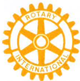
Rotary Club of Hamburg