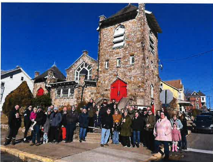
Community members attending the Ribbon Cutting at the Goathouse Church on February 1st. The Goathouse shared their story, mission, and origin of their name.

Below right: Twelve business leaders met at Hazel's café on Jan. 28th for a business workshop to discuss ways to better work together and promote Hamburg.